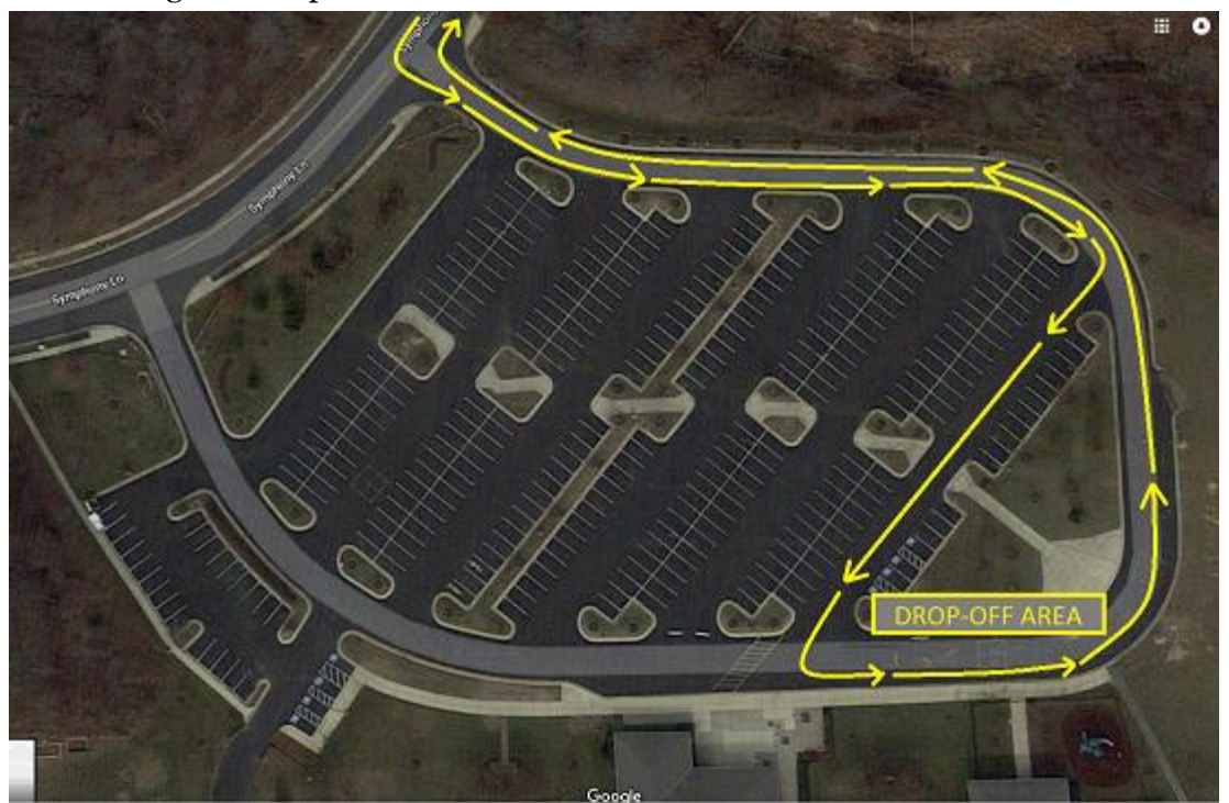
Pre-K - 1st grade Drop-off