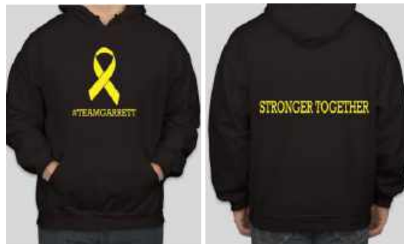
Hoodies - $25