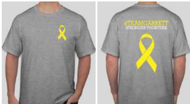
T-Shirts - $10

The link will be posted on SOTI studies and in the weekly parent newsletter.