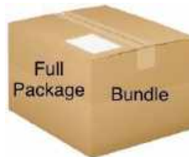
Full package bundle - $50

(Includes tee, hoodie, sticker, bracelet, & $10 SCRIP donation for the Brown Family!)