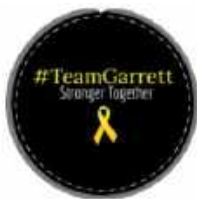
Sticker and Bracelet Combo - $5