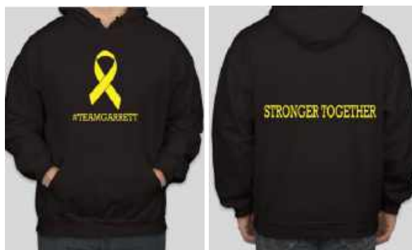
Hoodies - $25