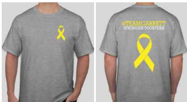
T-Shirts - $10

The link will be posted on SOTI studies and in the weekly parent newsletter.