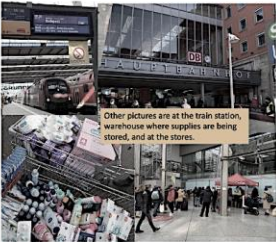
Other pictures are at the train station, warehouse where supplies are being stored, and at the stores.