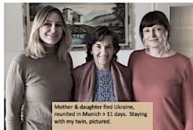
Mother & daughter from Ukraine, reunited in Munich > 11 days. Staying with my twin, pictured.