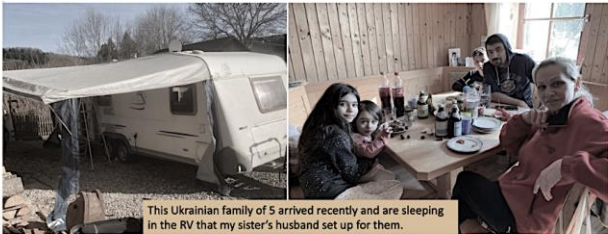
This Ukrainian family of 5 arrived recently and are sleeping in the RV that my sister's husband set up for them.

Supplies for local schools taking in Ukrainian students